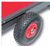
Set of air wheels.