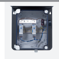
Digital timer, burning and ventilating.