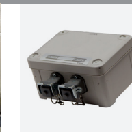
GSM temperature fault detector.