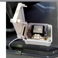
Fault detector GSM.