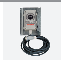
RT1, RT2, RT3